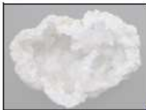
Via "Glacial Drifter" 3/17 Via "Clackamette Gem" 4/17