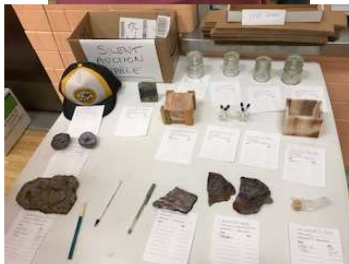
Silent Auction Items